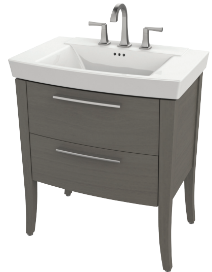
Townsend pedestal top sink 0328.008 shown with 9036.030 vanity and 7760.000 drawer pulls