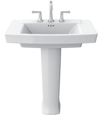
Townsend pedestal combination 0328.800